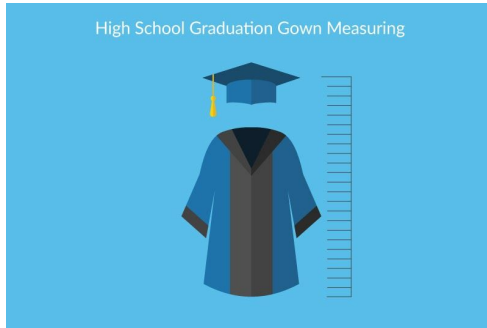
High School Graduation Gown Measuring