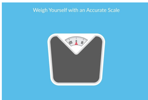
Weigh Yourself with an Accurate Scale

First, you need an accurate way to measure your height, such as a height chart that you can tape to a wall. Knowing your height is extremely important if you want to order a gown that fits. Once you've set up a height chart, stand up straight with your back pressed against the wall, just like how your parents measured your height when you were a kid. If you don't have a height chart, you can ask a friend to help you with a tape measure.